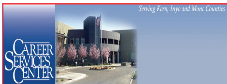
Serving Kern, Inyo and Mono Counties